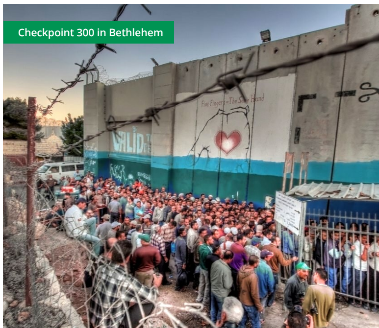
Checkpoint 300 in Bethlehem

— Israeli Prime Minister, Benjamin Netanyahu