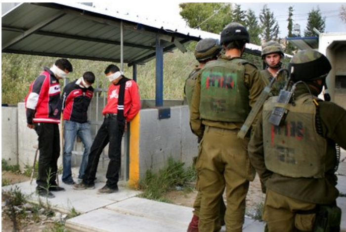
"Beit Iba Checkpoint; West Bank"